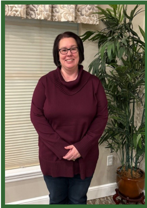
505 Fair Meadow