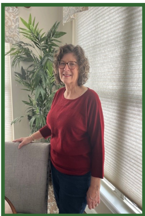
515 Fair Meadow