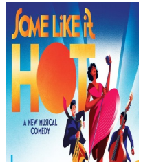
Some Like it Hot

Some Like It Hot Who says they don't make great big musical comedies like they used to? Some Like It Hot brings one of Hollywood's greatest comedies to new life on the Broadway stage. Don't miss the chance to join this fast-paced, sassy, brassy cross-country romp, as two best friends run for their lives – and find true love where they least expect it. Coming to the Benedum theater. Performance Date: : Wednesday, April 16, 2025, 5:45 PM at the clubhouse to catch the bus. Price:$ 132.00 each. Deadline: Wednesday, Oct. 9