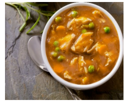
This Photo by Un-

Soup Night is Tuesday, February 6, 2024 @ 4:30. Please note the new time so you can arrive while it is light out. We are still in need of a few more soups. If you are able to make a crock pot of soup please contact Karen Neubauer at 724-229-6977. There will be soup, salad, bread and dessert. We will have a 50/50 raffle. See the signup sheet at the mail house. Deadline is February 1 st .