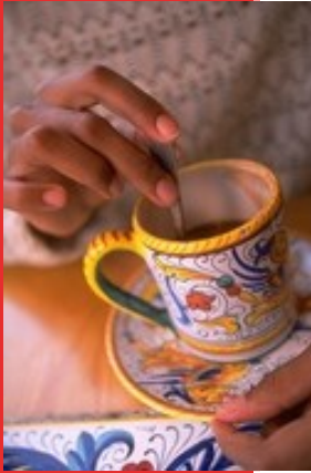
Breakfast with the Board April 6, 2024