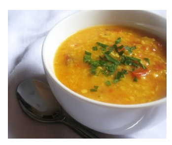
Our next social is Soup Night, on Tuesday, February 6th @ 4:30.